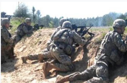
C Co Platoon LFX SBF