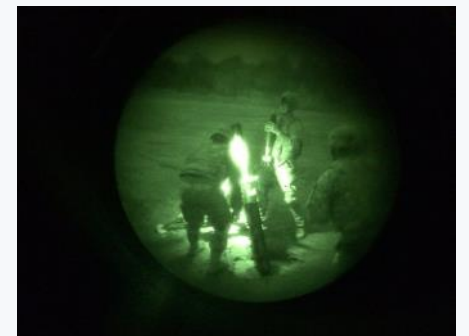
Mortar night live fire