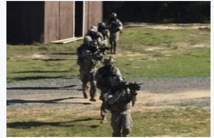
Alpha company platoon attack

Looking forward, 2-2 IN will end the training cycle with a cohesive battalion of fully qualified light Infantry Companies. The next quarter will focus on deployment readiness, and preparing the Ramrod Battalion for its first major training mission at Fort McCoy, Wisconsin in August.