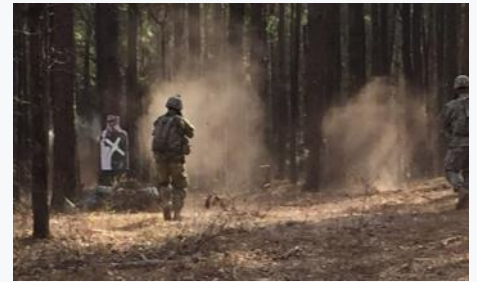
Squad live fire react to contact

The major training event for April was platoon maneuver live fires, which saw all nine of the Battalion's light infantry platoons conduct a breach and an attack on a village. Platoons were evaluated on their integration of all their internal weapon systems, equipment, and assets. Additionally, all Companies conducted an attack on an urban environment against a Platoon conducting an urban defense using marking munitions during the 10 – day field problem.