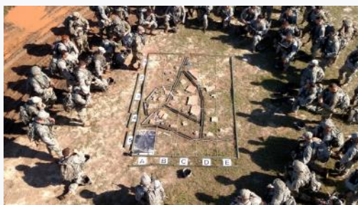
A Co Conducting TLPs