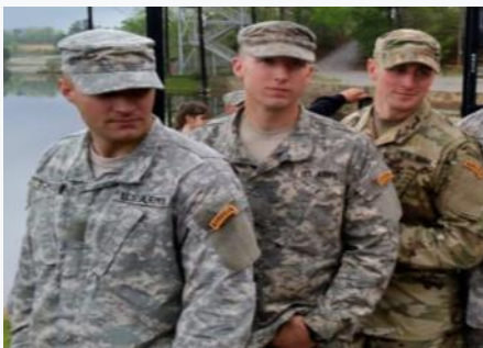
Ramrods graduate Ranger school