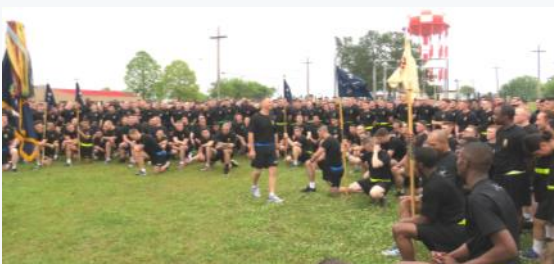
2-2 IN BN Run