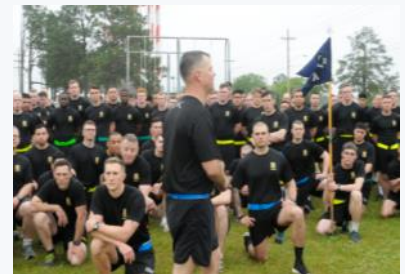
2-2 IN BN Run