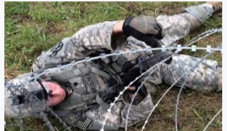
Platoon live fire breach