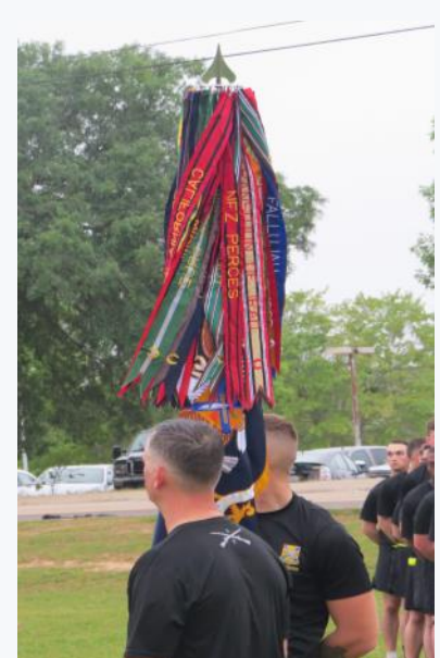
2-2 IN Colors and Streamers