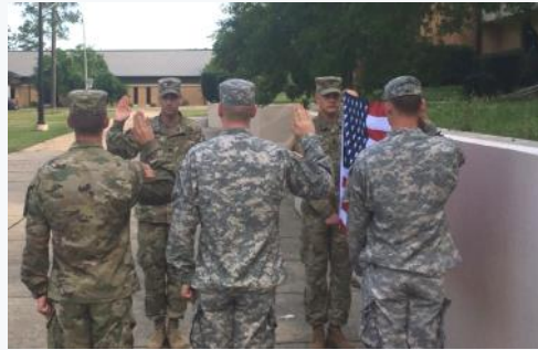
B Co Re-Enlistment