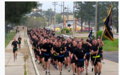
Battalion birthday run