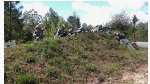
Platoon live fire support by fire